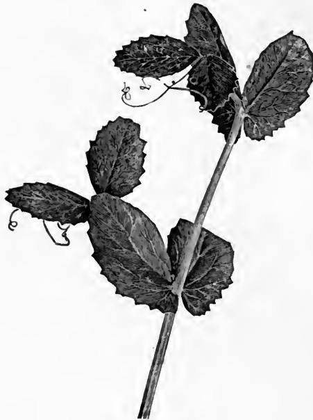
The Palestine Pea.

much resembled those of the Garden Pea, I clung to the hope that I had found an original form of that Pea, rather than of the Field Pea, especially as there was no colour in the axils, a character which is invariably seen in every commercial type of " Pisum arvense " I have met with, and is always associated with coloured flowers.